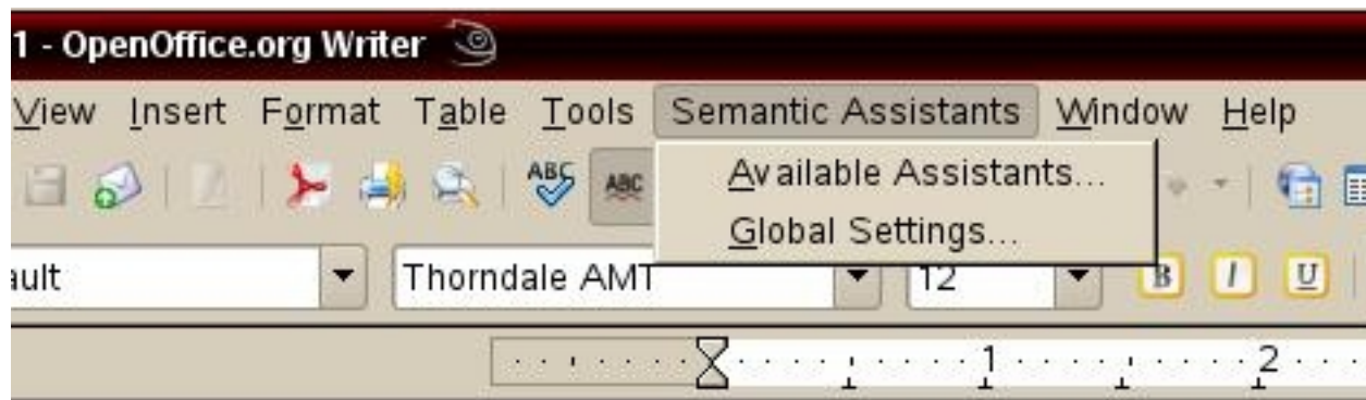
Assistants menu in OpenOffice

The Semantic Assistants plug-in is basically a Java archive (JAR) file that ships with its own specific content and a description file to introduce itself to the OpenOffice plug-in loader. Once the Semantic Assistants plug-in is installed, it adds a new menu item to the OpenOffice toolbar through which a user can inquire about available Natural Language Processing services and execute them on one the current document.